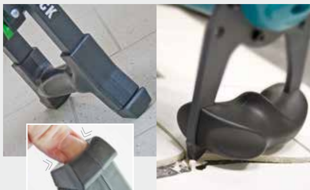
Damping and protection elements made of polyurethane – protection of the machine and the surface in case of unintentional fall