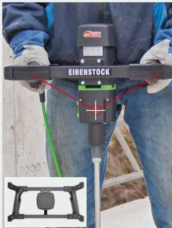
Wide, trapezium design, ergonomic handles and balanced center of gravity – easy, well balanced guiding of the machine for greater leverage